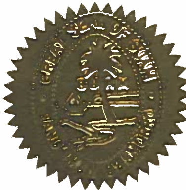
JOSHUA F. TENORIO Sigundo Maga'låhen Guåhan Lt. Governor of Guam

A handwritten signature in black ink, appearing to read "Joshua F. Tenorio".